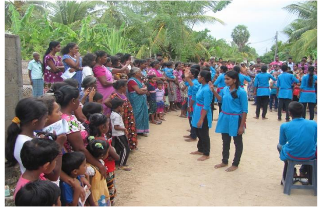
Safe labour migration awareness through street Drama