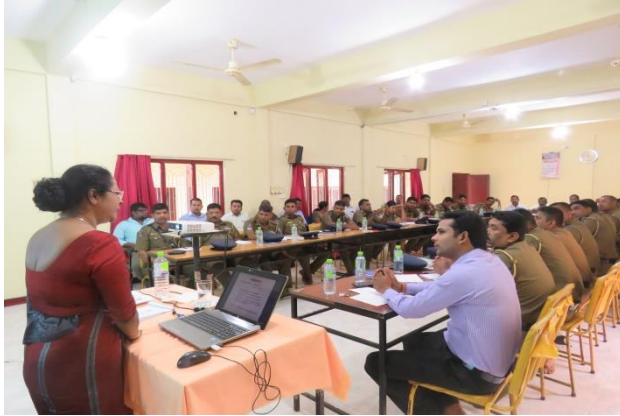
Human Trafficking training for Police and other government officers